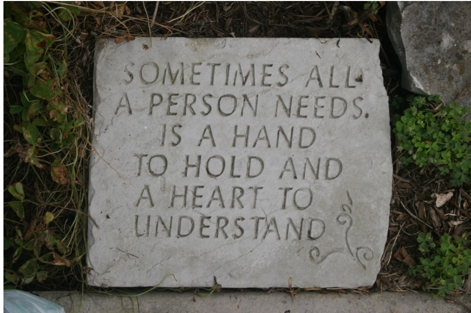
The garden rock from his daughter that expresses her appreciation for her dad's care for her mother